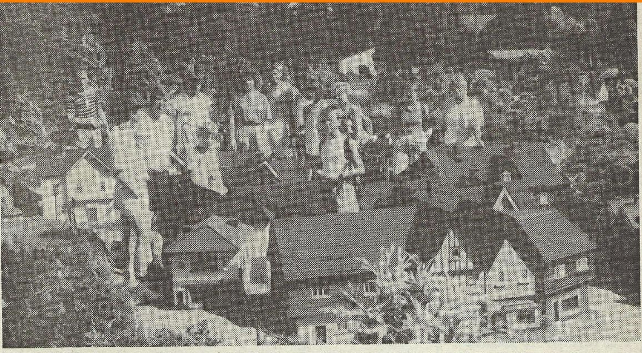
Mit 23 Kindern und Jugendlichen war der Bensheim-Amersham-Freundeskreis in England. Hier besuchte man die Miniaturstadt BeaconsCourt.

Maybe — they liked the way we carefully approach every customer and made every effort to give them the best service